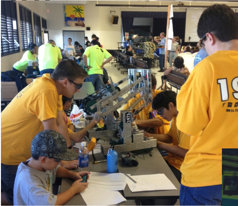
VEX Robotic Competition