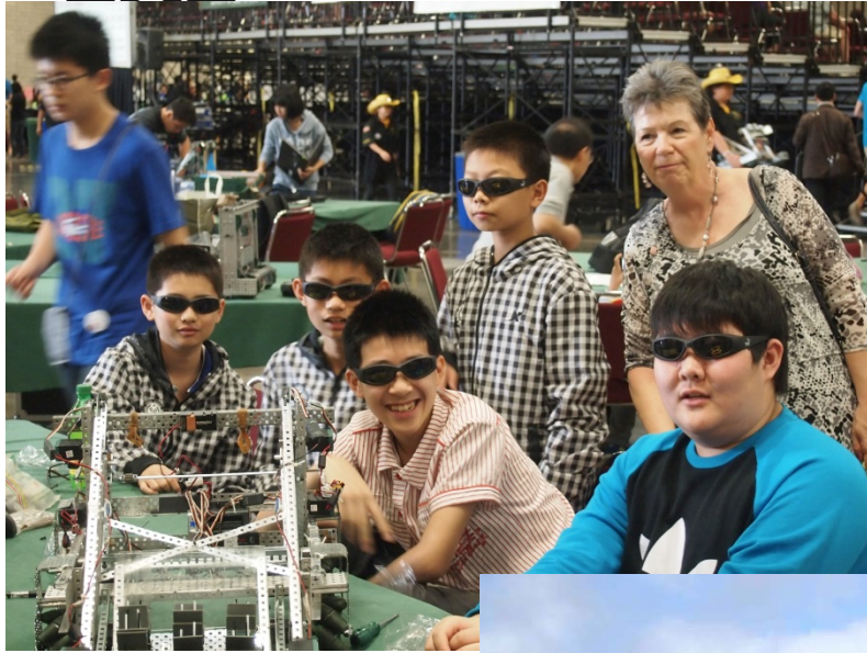
Hawai`i State Robotics ROC

First Annual Pacific Astronomy and Engineering Education Summit